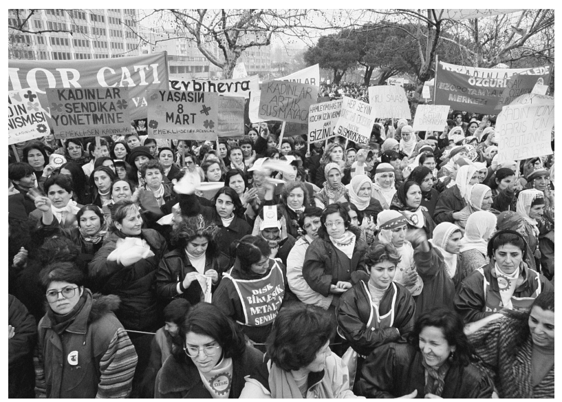
8<sup>TH</sup> of March in Istanbul

Rape : Rape and sexual assault have been regulated in Article 102 of the Penal Code entitled "Sexual Assault." While punishment for sexual assault varies from two to seven years, the prison sentence for rape can be up to 12. The crime of rape now includes the insertion of a sexual organ or object into the body.