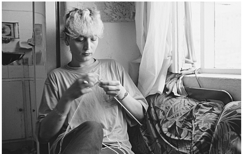
A TRANSVESTITE IN ISTANBUL.

was later removed due to the intervention of the Minister of Justice. Women's and LGBT groups are continuing to advocate for this amendment.