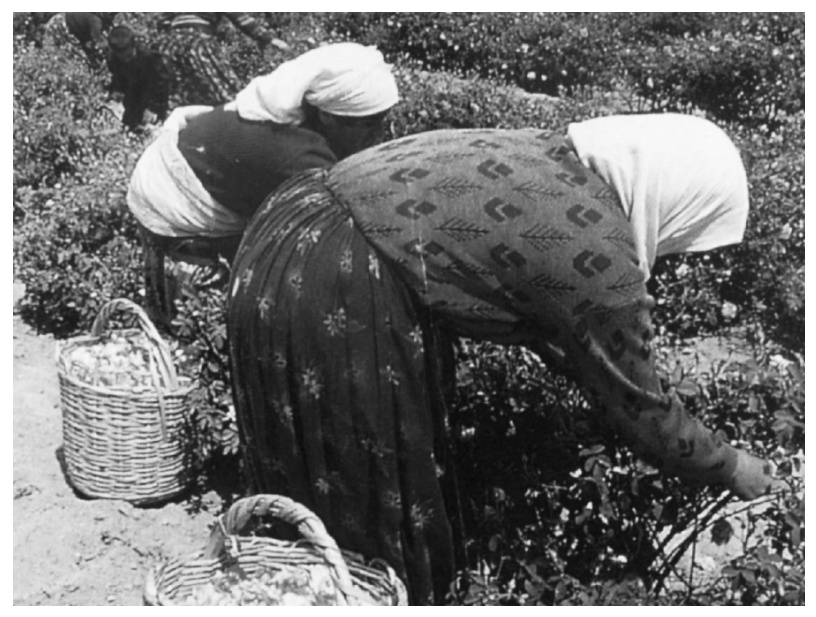
The New Civil Code Recognizes the Hitherto Invisible Labor of Women Working for Their Families.

declare their decision in writing while applying for authorization to marry.