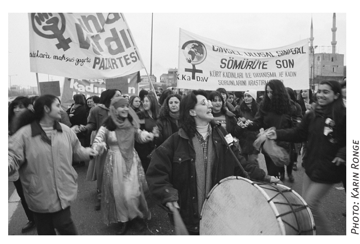
March 8<sup>TH</sup> Demonstration in Istanbul

February, 2005 Women for Women's Human Rights (WWHR) – NEW WAYS