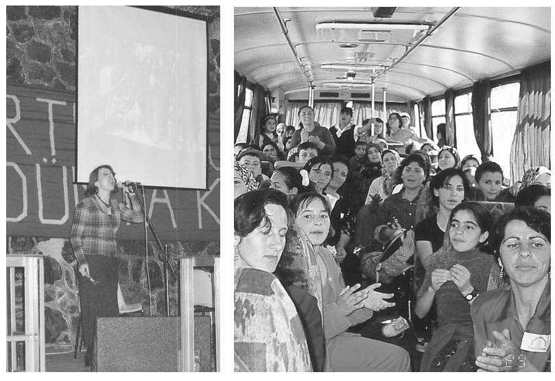
Celebrating The New Civil Code attained through Joint Action by Women's Groups.

Place of residence : With the new Civil Code, spouses jointly choose where they will live (Article 186 of the Civil Code). This is a positive change from the old clause, which assigned the decision-making power concerning place of residence to the husband. Besides, the clause that the wife's place of residence is the residence of her husband has been deleted from the definition of legal domicile. Under Turkish law spouses have to live together (Article 185 of the Civil Code).