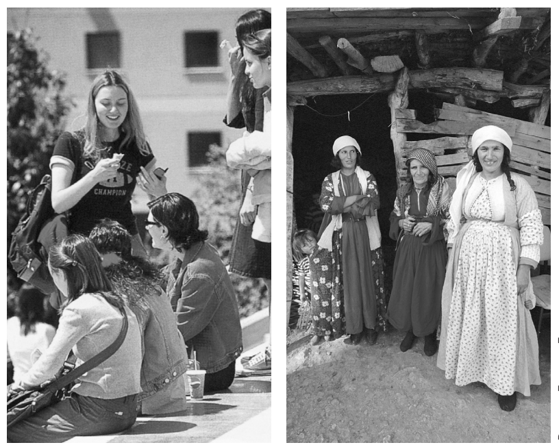
"PROBLEMS RESULTING FROM REGIONAL DIFFERENCES IN SOCIO-ECONOMIC CONDITIONS GET WORSE AS ONE MOVES FROM WEST TO EAST. THESE HAVE A NEGATIVE IMPACT ON THE OVERALL STANDARDS OF LIVING, THE EFFECTS OF WHICH ARE EXPERIENCED MORE BY WOMEN THAN MEN." (P. ILKKARACAN, WOMEN AND SEXUALITY IN MUSLIM SOCIETIES , ISTANBUL, 2000, p. 230)

There are two basic criteria for competence: age and the ability to discern.