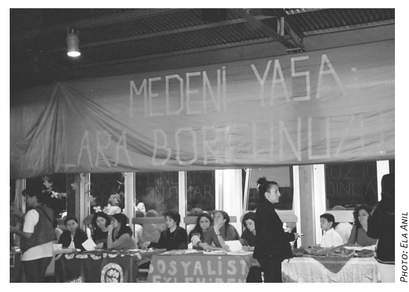
Women's Festival, March 8<sup>TH</sup>, 2002. "Civil Code: Settle Your Debts to Women."

The law specifies a minimum share of the deceased's estate, which must go to the surviving spouse, children, parents or grandparents (Article 506 of the Civil Code).