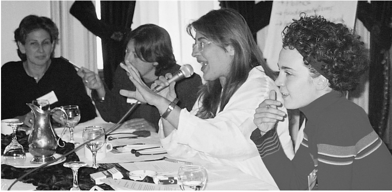
Honor Crimes was One of the Items Discussed in the Symposium on Woman, Sexuality and Social Change in the Middle East and the Mediterranean Organized by WWHR-New Ways in 2001.

to life imprisonment; hopefully these will set precedent for severe punishment of similar crimes. Despite the inadequate measures in the Penal Code, the amendments provide an initial step in overcoming the legitimization of this practice.