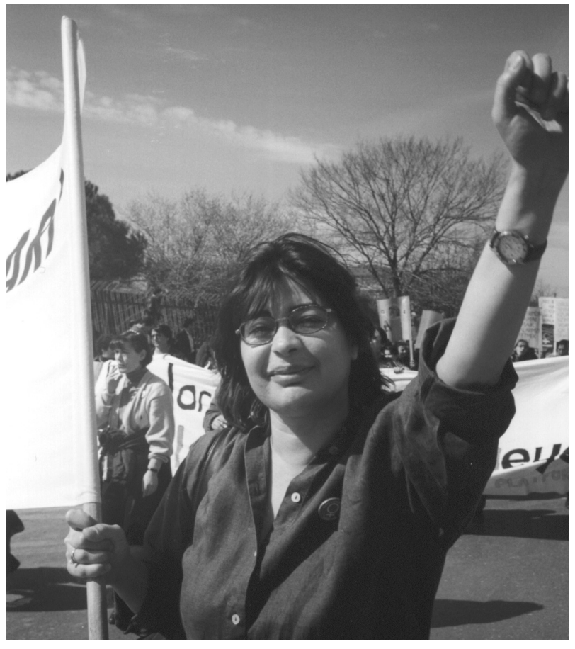
STOP VIOLENCE AGAINST WOMEN.

The Public Prosecutor can file charges at the Penal Court against a spouse who does not abide by an order. A spouse who has not abided by a protection order can be sentenced to a prison sentence of three to six months.