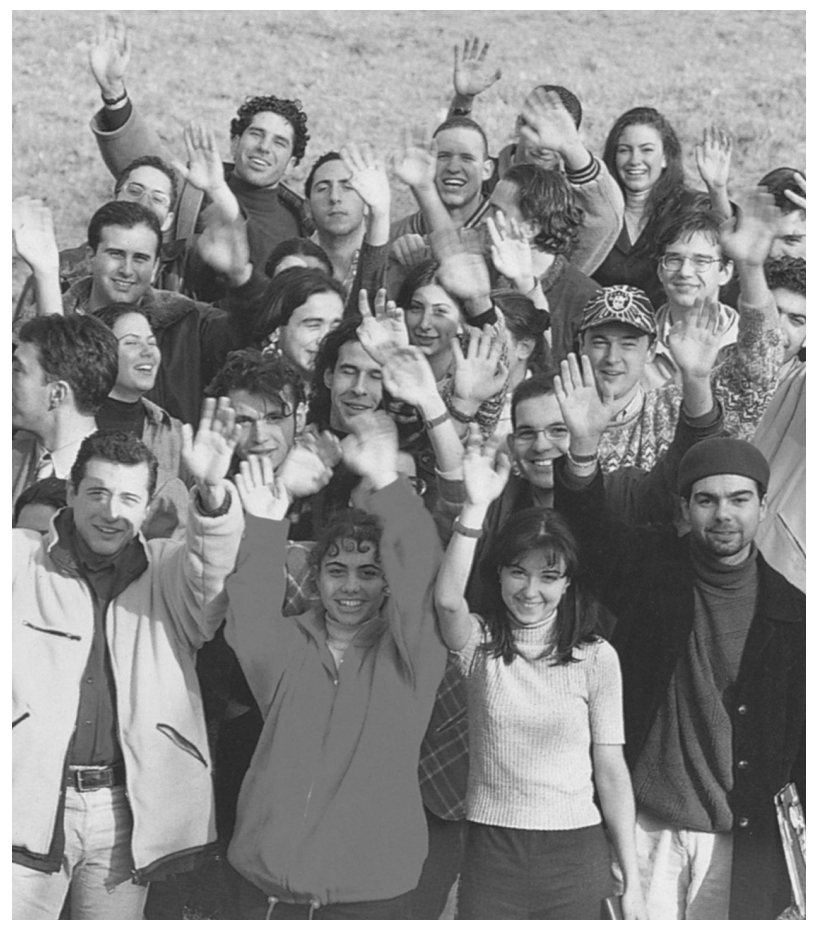
"For Years You are Taught that Sex and Sexuality is the Devil to be Feared. Then, in One Night, it is Supposed to Become the Angel to be Loved. This is Just not Possible!" (a Participant from WWHR's Human Rights Training for Women)

such circumstances as: alleged rape, sexual conduct with minors, and encouraging or acting as an intermediary for prostitution. In the case of such crimes, if there are no other means of proving the alleged crime or if the passage of time may interfere with gathering evidence for the case, the judge may order a vaginal or anal examination without the consent of the woman. The judicial decree must