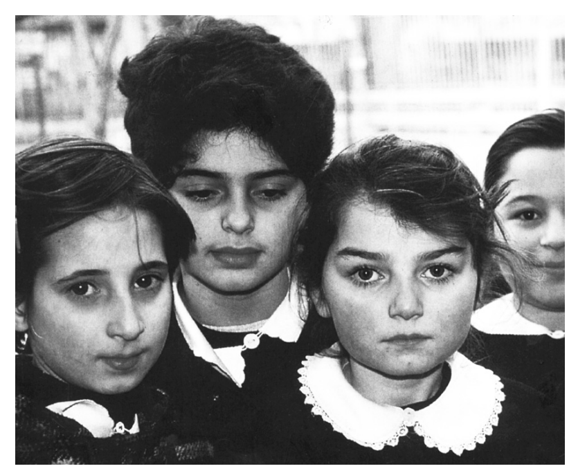
MOTHERS SHALL NOW HAVE EQUAL SAY OVER MATTERS CONCERNING THEIR CHILDREN.

Parents are responsible for providing their children with appropriate formal and religious education (Articles 340 and 341 of the Civil Code). Parents name their children, represent them in relations with third parties, educate them according to their means and also ensure and protect their physical, mental, emotional, moral and social well-being (Articles 340 and 342 of the Civil Code).